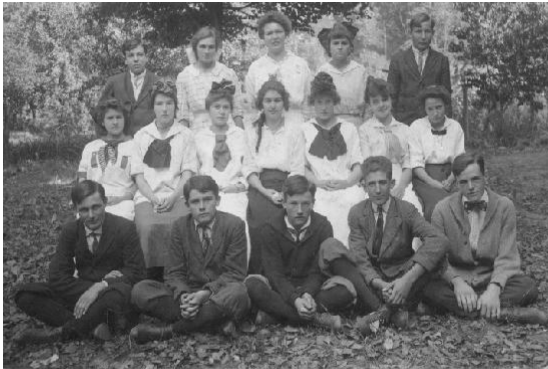
1913 Class Photo

Information provided by: Richelle (Pickering) Emery